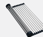
Rollermat Model Code: BDRM40X