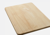
Chopping Board Model Code: BDCB30K